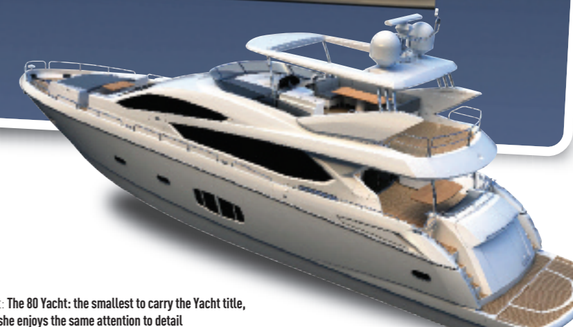
Right: The 80 Yacht: the smallest to carry the Yacht title, but she enjoys the same attention to detail

“...Sunseeker has built a reputation as the manufacturer of the world's finest luxury motoryachts...”