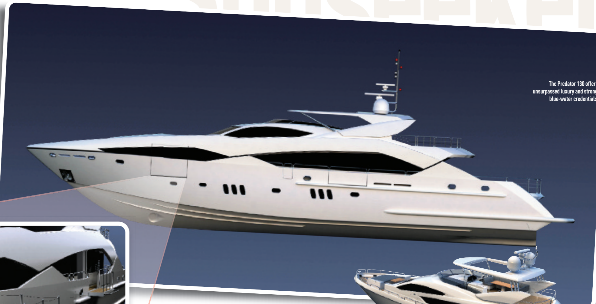
The Predator 130 offers unsurpassed luxury and strong blue-water credentials

Both open and hardtop versions are available. And as well as a