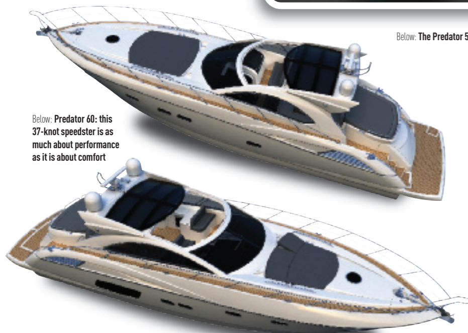
Below: Predator 60: this 37-knot speedster is as much about performance as it is about comfort

sedate pleasures. A lazy lunch on the aft cockpit is perfectly complemented by an afternoon playing on the water toys easily launched from a submersible platform that doubles as toe-dipping beach.