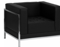
SORRENTO CHAIR BLACK