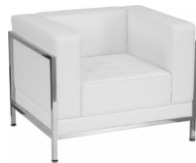
SORRENTO CHAIR WHITE